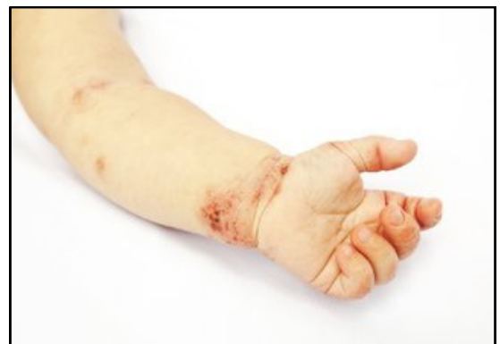
Eczema (atopic dermatitis) is a red, itchy, scaly rash that can be painful.

These antibodies aren't something we want when they're connected to everyday substances like dust, pollen or other hard-to-avoid particles. We also don't want them in connection with common foods, like egg, milk and peanuts. The environmental samples collected by SUNBEAM families, together with careful monitoring of your child for eczema and later, allergy testing, are intended to help researchers understand more about how these factors come together. At the same time, allergy testing will help you understand more about food and environmental allergies your child might develop.