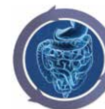
INTESTINE AND MULTIVISCERAL

Expert physicians and surgeons in each of these areas use advanced therapy and technology to deliver innovative, safe and effective care to ensure the best possible outcome and recovery.