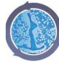
BONE MARROW STEM CELL

Our specialized organ transplant teams function across seven transplant areas: